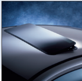
Sunroof panel vents or opens fully.