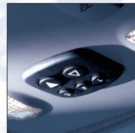
Soft-Touch® illuminated, user control panel.