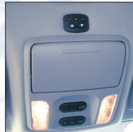
Soft-Touch®, illuminated, user control panel mounts in convenient position.