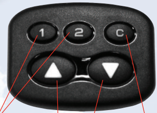
2 Programmable Positions Open Close/Vent Soft-Touch® Close from any Position