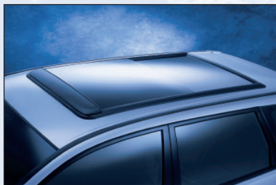
Smooth lines enhance the exterior appearance of any vehicle.