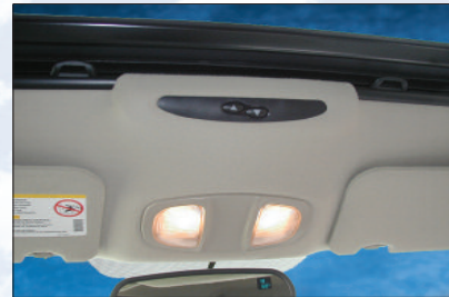
Switch mounts in useful location.