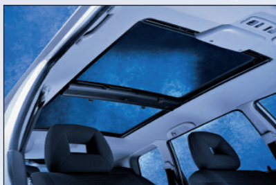
Front panel closed, all 4 sunshades open.

The LARGEST aftermarket sunroof available!