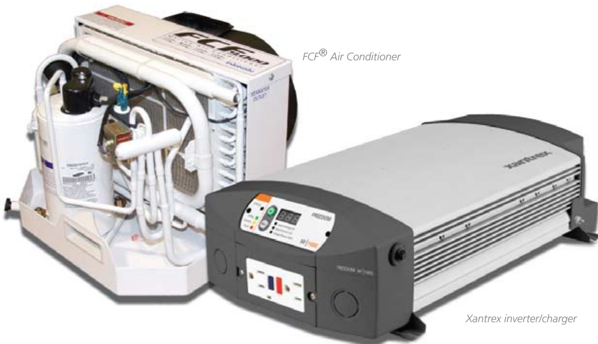
FCF® Air Conditioner