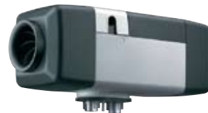
Air Top 3500 ST 5,000-12,000 BTU