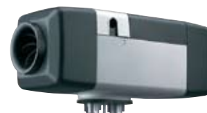
Air Top 5000 ST 5,000-17,000 BTU