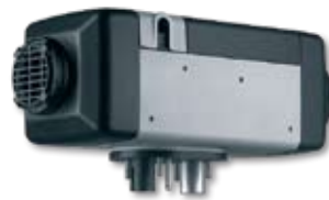
Air Top 2000 ST 3,000-7,000 BTU

Our specialists can provide you with more information about this topic - for example, about the influence of the water temperature in your operating waters on your choice of heating system. Simply contact one of our expert service points for individual advice.