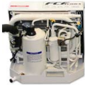
FCF 12000 12000 Btu