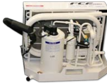
FCF 16000 16000 Btu