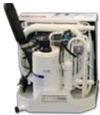
FCF 5000 5000 Btu