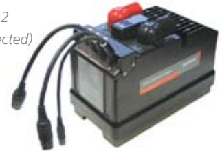
Xantrex IP1012 (Ignition Protected)

FCF-DV (Dual Voltage) models available. Includes either a 5,000 or 9,000 Btu unit with WB250 50/60Hz water pump and 1000 or