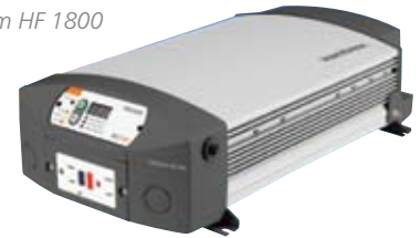
Freedom HF 1800

FCF-DV (Dual Voltage) models available. Includes either a 5,000 or 9,000 Btu unit with WB250 50/60Hz water pump and 1000 or