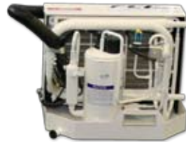
FCF 9000 9000 Btu